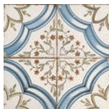
20402 FS.MOAR DM14 (45x45) (4-2-H)*** CLASE 2 350 6 gráficas/patterns