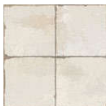
13305 FS-0 DM14 (45x45) (4-1-H)**** CLASE 1 350 13 gráficas/patterns