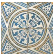
12500 FS-1 BM14 (45x45) (5-1-H)**** CLASE I P-9 10 gr/g/cas/patterns