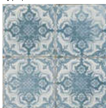
12518 FS-3 BM14 (45x45) (5-1-H)**** CLASE I P-9 8 gr/g/cas/patterns