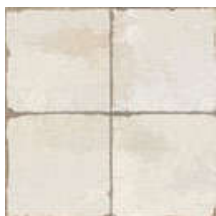
12305 FS-0 BM14 (45x45) (4-1-H)**** CLASE I P-9 13 gr/g/cas/patterns